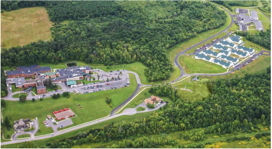
An aerial view of Sitrin's 280-acre main campus located in Upstate New York.

For more information, visit SitrinNeuroCare.com